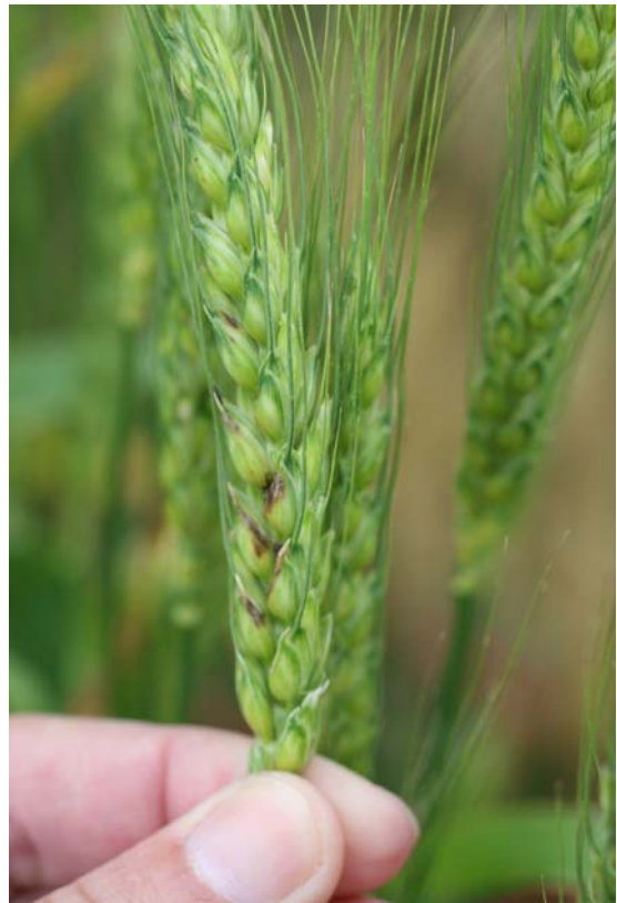
Great resistance is hard to combine with superior agronomics.

In spite of these breeding successes, challenges remain. The biggest breeding challenge lies in combining scab resistance with agronomic superiority and acceptable milling and baking quality. The next challenge is convincing farmers to grow resistant varieties. Once a cultivar is released, it will not have a large impact unless it is grown on significant acreage and that means that farmers must choose to plant it.