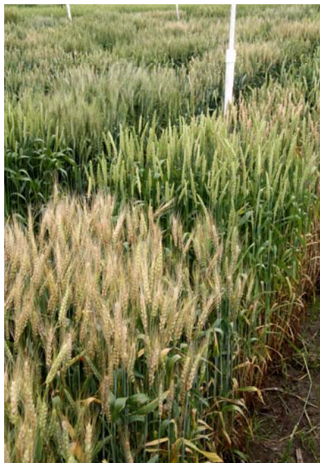
Truman (rear) vs susceptible (foreground)

Given the importance of resistant varieties, how have USWBSI breeding programs impacted the wheat variety profile in the region? The University of Missouri has released Truman and Bess with the help of USWBSI funds. Although there are no data on which varieties are being grown in Missouri, based on seed sales, Truman is produced on more acreage in Missouri than any other public variety. Also being grown are Bess, Ernie and Roane (a Virginia Tech release) – each of which has a level of resistance that is very functional in production fields. Based on seed sales, there is some acreage of Truman outside of Missouri from southeast Kansas through to New York State. The trajectory of those sales outside Missouri is still increasing – suggesting that acreage planted to this resistant variety is also increasing.