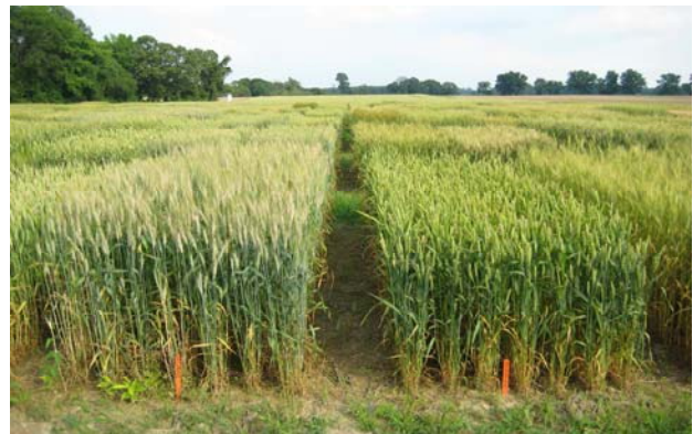
Susceptible and resistant varieties in MD variety trial.

Jose Costa, University of Maryland wheat breeder, "... high infection levels had shown up at three Eastern Shore yield trial locations ... Differences between susceptible varieties and those with at least moderate resistance were very apparent..."