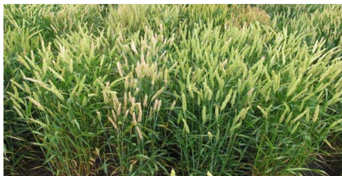
Resistant IL line (right) vs susceptible line (left).

In the past three years, the University of Illinois wheat breeding program has released a number of breeding lines with moderate to high levels of FHB resistance for commercial production as licensed varieties. Some of these varieties are available from seed companies under the company's branded name. Several additional breeding lines with FHB resistance are being increased, but several seasons are required for seed multiplication before large quantities of seed will be available for producers.