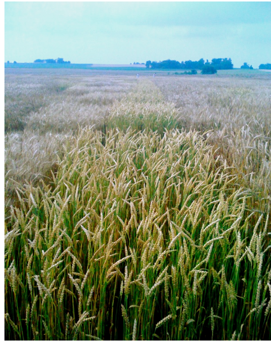
Pass of Truman plots flanked by susceptibles.

The Ohio State University recently released two public cultivars, Bromfield and Malabar, with high yield potential and scab resistance. These were developed with funding from the USWBSI. Both yield about 3 bushels/acre better than the standard Hopewell and have 60% less head symptoms than the susceptible check, and about 15% less head symptoms than a moderate resistant check. They have about 55% less toxin in their grain than a susceptible check, and 15% less toxin in their grain than a moderately resistant check.