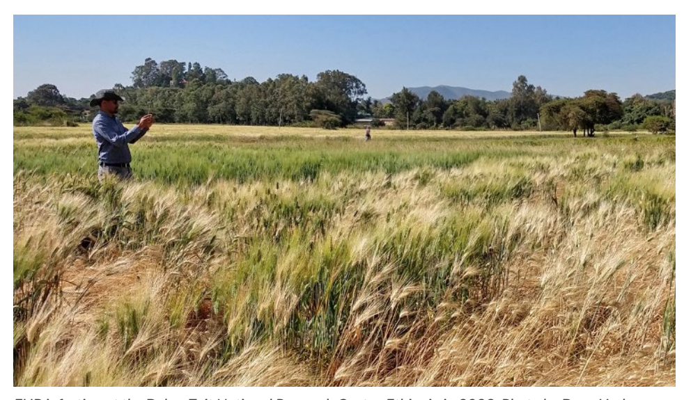
FHB infection at the Debre Zeit National Research Center, Ethiopia in 2022.

In Ethiopia, FHB is rapidly emerging as one of the most challenging diseases of wheat, limiting production in some areas. Outbreaks have occurred in the last three years, including a severe epidemic in the 2022/23 growing season. FHB has become a major concern to Ethiopian wheat farmers, researchers, and government authorities. These outbreaks