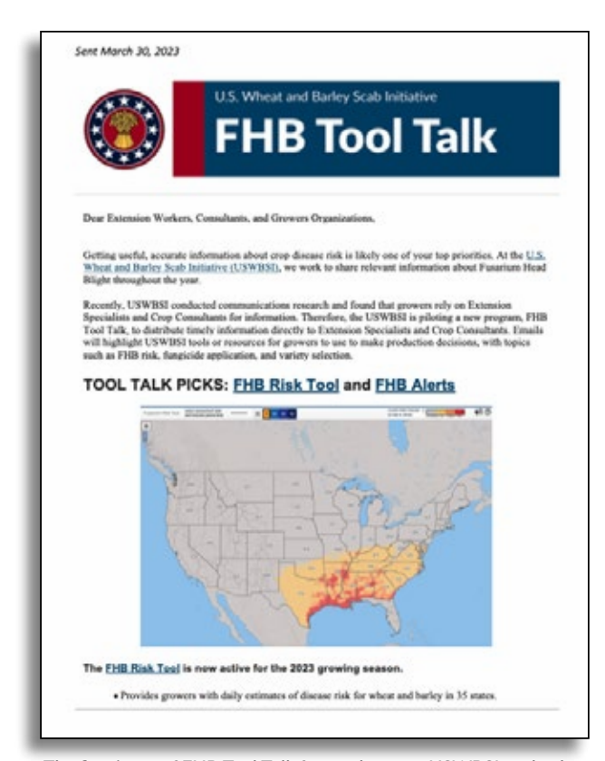
The first issue of FHB Tool Talk focused on two USWBSI tools, the FHB Risk Tool and FHB Alerts.

The first e-newsletter, distributed in April, made readers aware of the FHB Risk Tool and FHB Alerts. These USWBSI tools allow users to see the forecasted risk of FHB for their wheat and barley fields to determine if FHB management using fungicide application is necessary and provides state commentary about the season's progression. The second e-newsletter in May provided new information about the best time for fungicide application in winter barley to reduce FHB. The most recent issue provides news about the re-broadcast of Scabinar, a two-hour webinar that provides insights on FHB and the best ways to manage it and its associated mycotoxin, which now has the option for Certified Crop Advisors to earn up to two continuing education units in integrated pest management if they watch the recordings and take the associated quizzes.