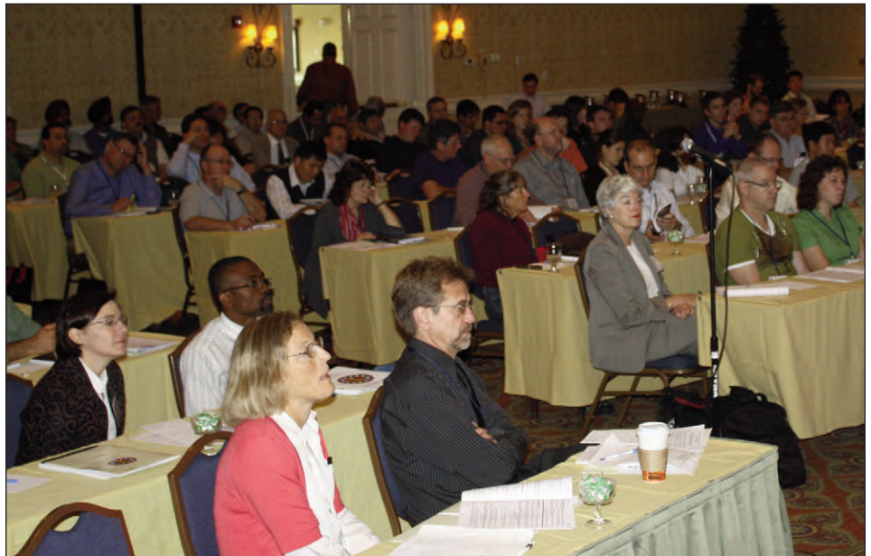
Above: USDA and university scientists, grain industry personnel, commodity group representatives and growers from several states were in attendance at the 2009 FHB Forum in Orlando.

The following pages feature photos and narrative describing highlights from the 2009 FHB Forum. The event's entire proceedings can be found on the USWBSI website: www.scabusa.org . ♦