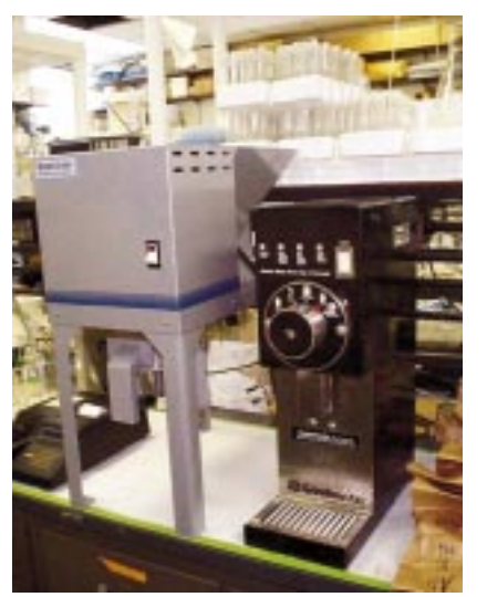
In their research to find better ways to sample grain for DON analysis, MSU researchers have found that a professional grade coffee grinder (at right, bought used for $400) can be as effective at preparing a grain sample for DON analysis as industry sampling equipment (left) that can cost more than five times as much. More cost-effective testing methods would benefit country elevators and may lead to infield DON sampling in the future.

for DON analysis faster than industry sampling equipment that costs over $2,000.